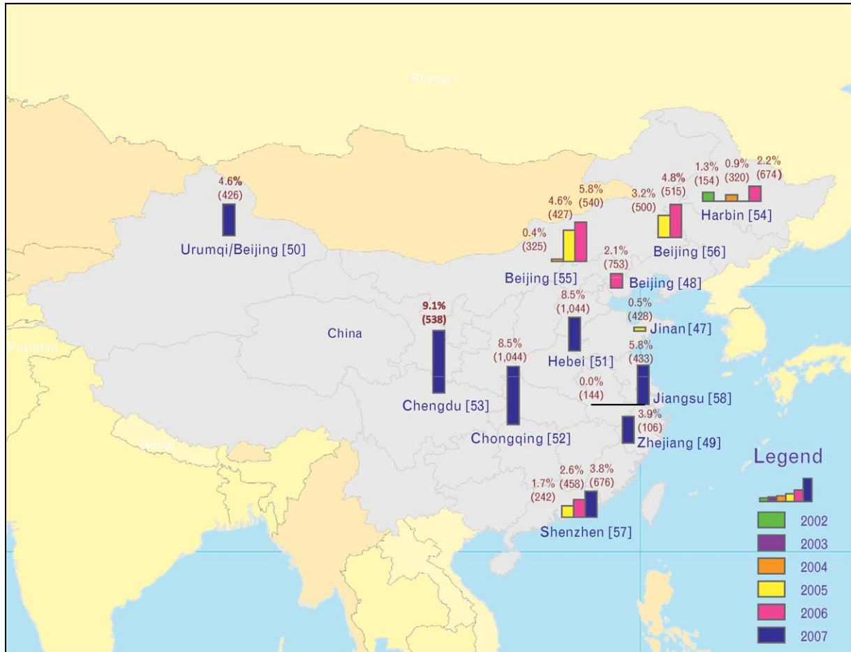
Figure 2 HIV prevalence among men who have sex with men in China

among MSM attending STD clinics in Beijing, the estimated HIV incidence was 2.9% in 2005 and 3.6% in 2006 [66].